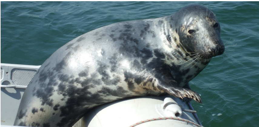
Tony Chapman, 'Casper'

The seal made itself comfortable for about ½ an hour but finally objected to being towed up river.