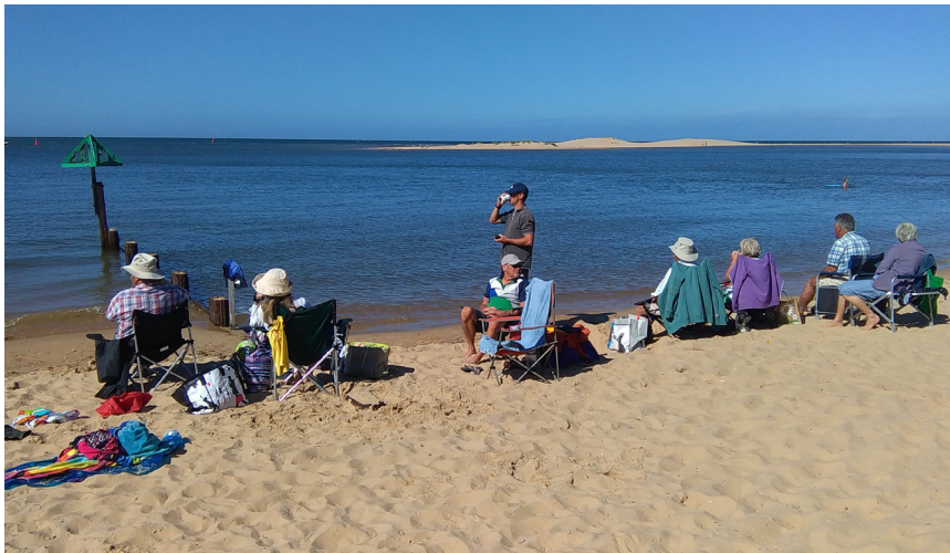
URYC members on the look-out for Streakers in Norfolk